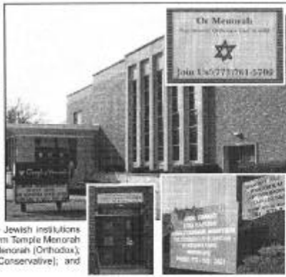
SHARING SPACE — Three Jewish institutions share space with the Reform Temple Menorah (clockwise from top): Or Menorah (Orthodox), Ner Tamud (Egalitarian Conservative), and Cheder Lubavitch.